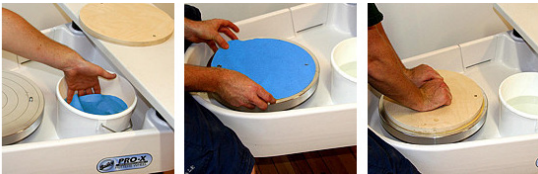
Soak in water Place on wheel Press bat down

WARNING: rinse new batmate in warm water prior to use.